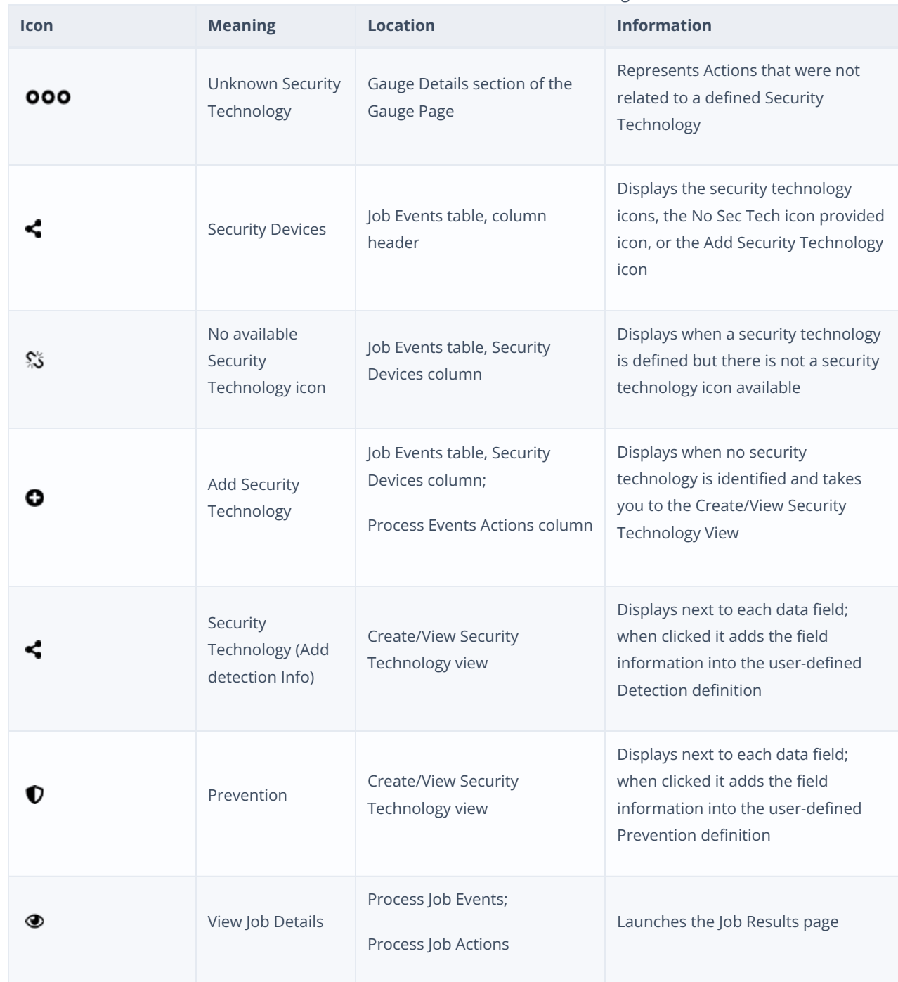
Icons used on Effectiveness Validation Process Pages

There are some icons you will see as you go through the Effectiveness Validation Process and add new security technology definitions. You'll also see several of these icons on the Gauges and when reviewing Jobs.